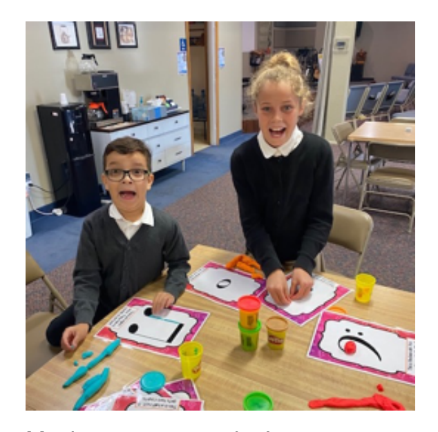
Music assessment day!